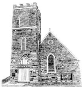
January at Trinity

Trinity Episcopal Church 703 S. Main Street Office: 701 S. Main Athens, PA 18810