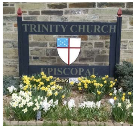
It's Gardening Season! Finally.

Work on the apse, the area around the altar, was delayed, but should begin this coming week. This will mean there will likely be scaffolding in place for a few weeks while the crumbling and peeling plaster is scraped, patched, and repainted. Money for this project was set aside last year and carried forward into the 2015 budget.