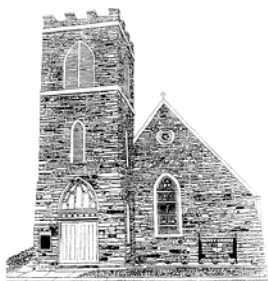
March at Trinity

Trinity Episcopal Church 703 S. Main Street Office: 701 S. Main Athens, PA 18810