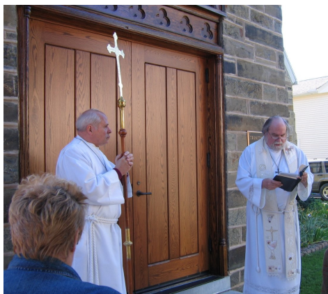
Dedication of our new doors, Trinity Sunday