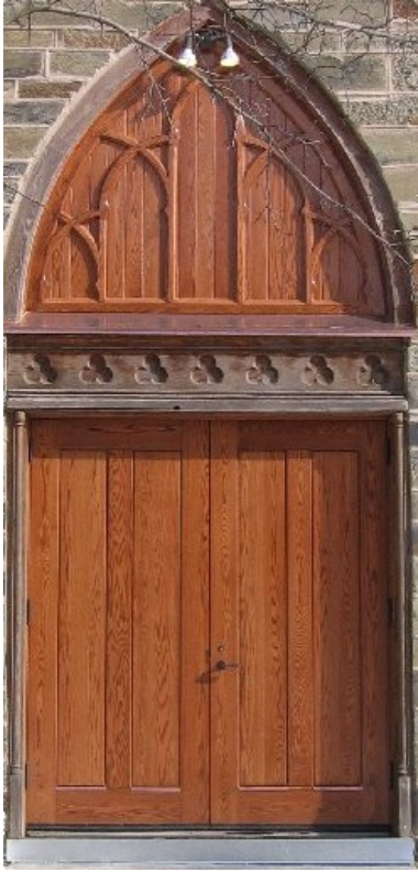
Dedication of our new doors, Trinity Sunday, May 26. On our

name day, we invite you to join us for a special service of thanksgiving and the dedication of the new church doors. Many people worked very hard over the past few years to oversee the renovation project. Help us celebrate!