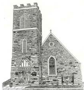
Summer at Trinity

Trinity Episcopal Church 703 S. Main Street Office: 701 S. Main Athens, PA 18810